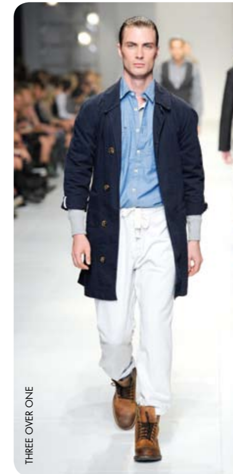
THREE OVER ONE