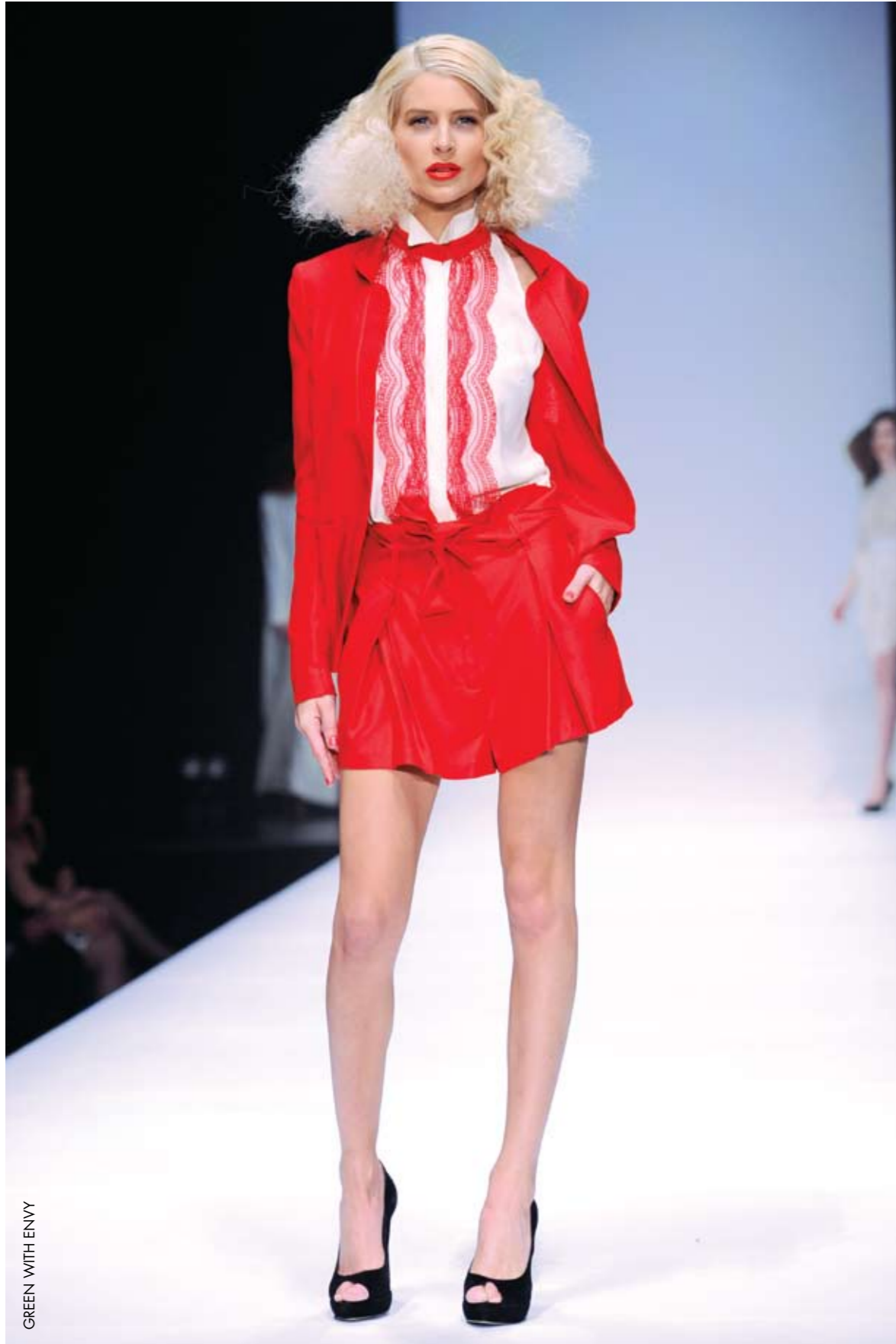
GREEN WITH ENVY