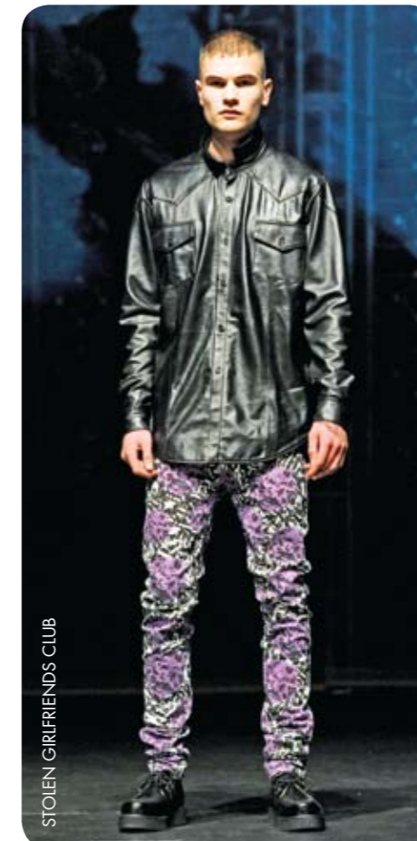
STOLEN GIRLFRIENDS CLUB